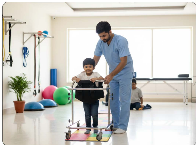
Safer gait training sessions